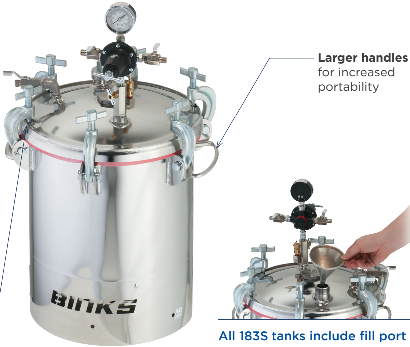
All 183S tanks include fill port