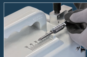
• Length scale