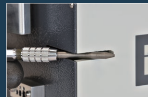
• Notching function