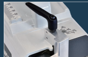
• Angle scale