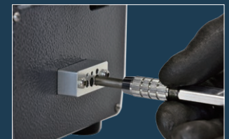
• Tip flat block