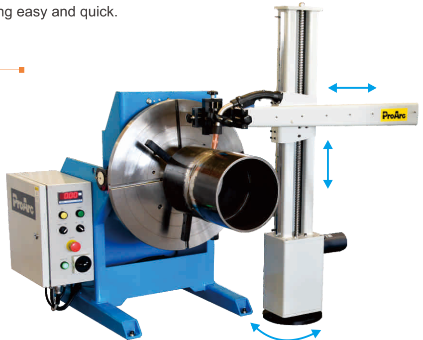
■ MP-0606 with PT-750