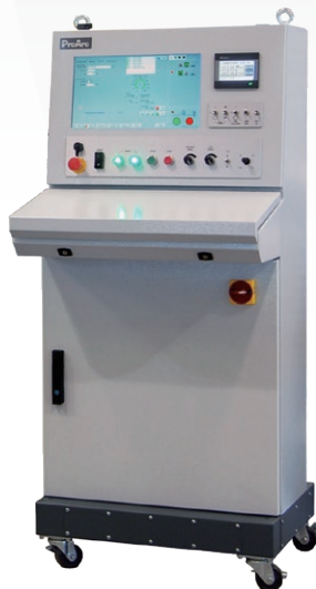
• ProArc CNC controller