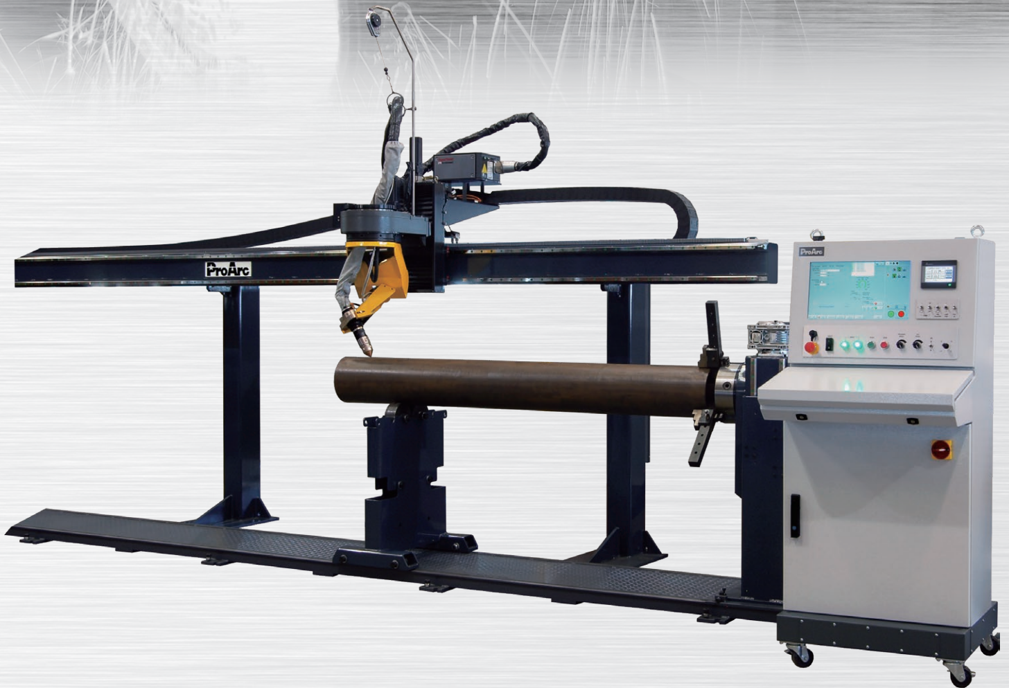
CNC Cutting Machine