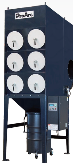
• ProArc Dust collector